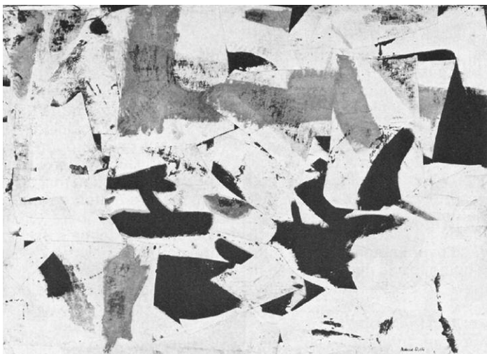
Conrad Marca-Relli, R-I-4-58 (White Night), 1958. Painted canvas collage. 56 x 77"

Conrad Marca-Relli's paintings from 1955-63 have more texture than the best-known sculpture from that period. He gives evidence of his touch even in smooth metal collages; it shows along the edges of their flat steel sheets. His paintings offer a variety of fabrics, from oil cloth to burlap, played off against viscous or tarry or stained-in pigment. This gives Marca-Relli, a member of the New York School's first generation, something in common with a minimalist sculptor: both are interested in physicality, an aspect of objects which, for all its familiarity, appears in a wide range of modes.